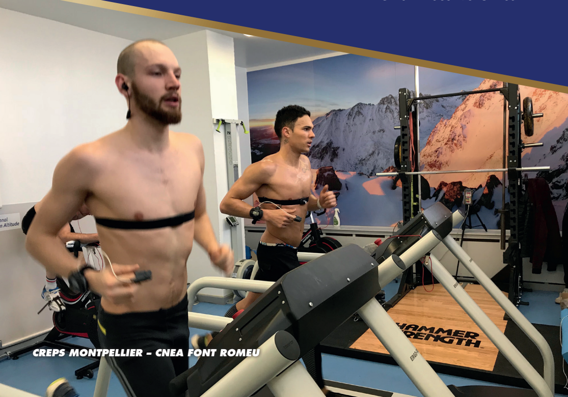
CREPS MONTPELLIER – CNEA FONT ROMEU