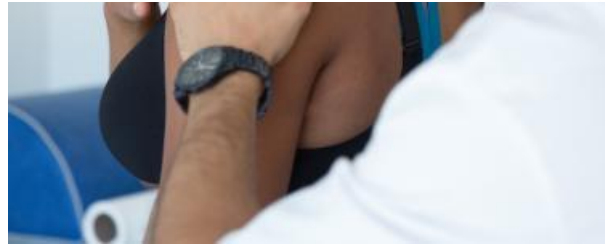
Health care and dental treatment centre