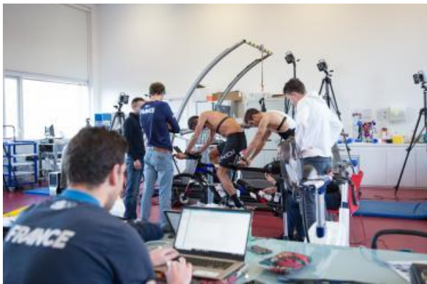
Performance services offerings