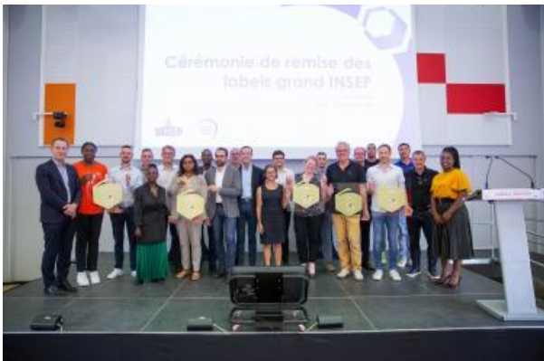
grand INSEP label